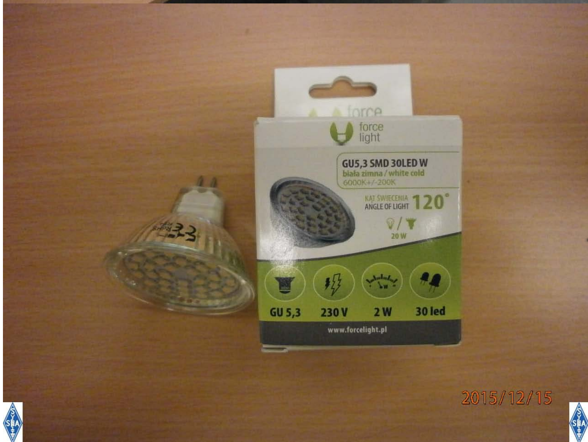
Actual test setup