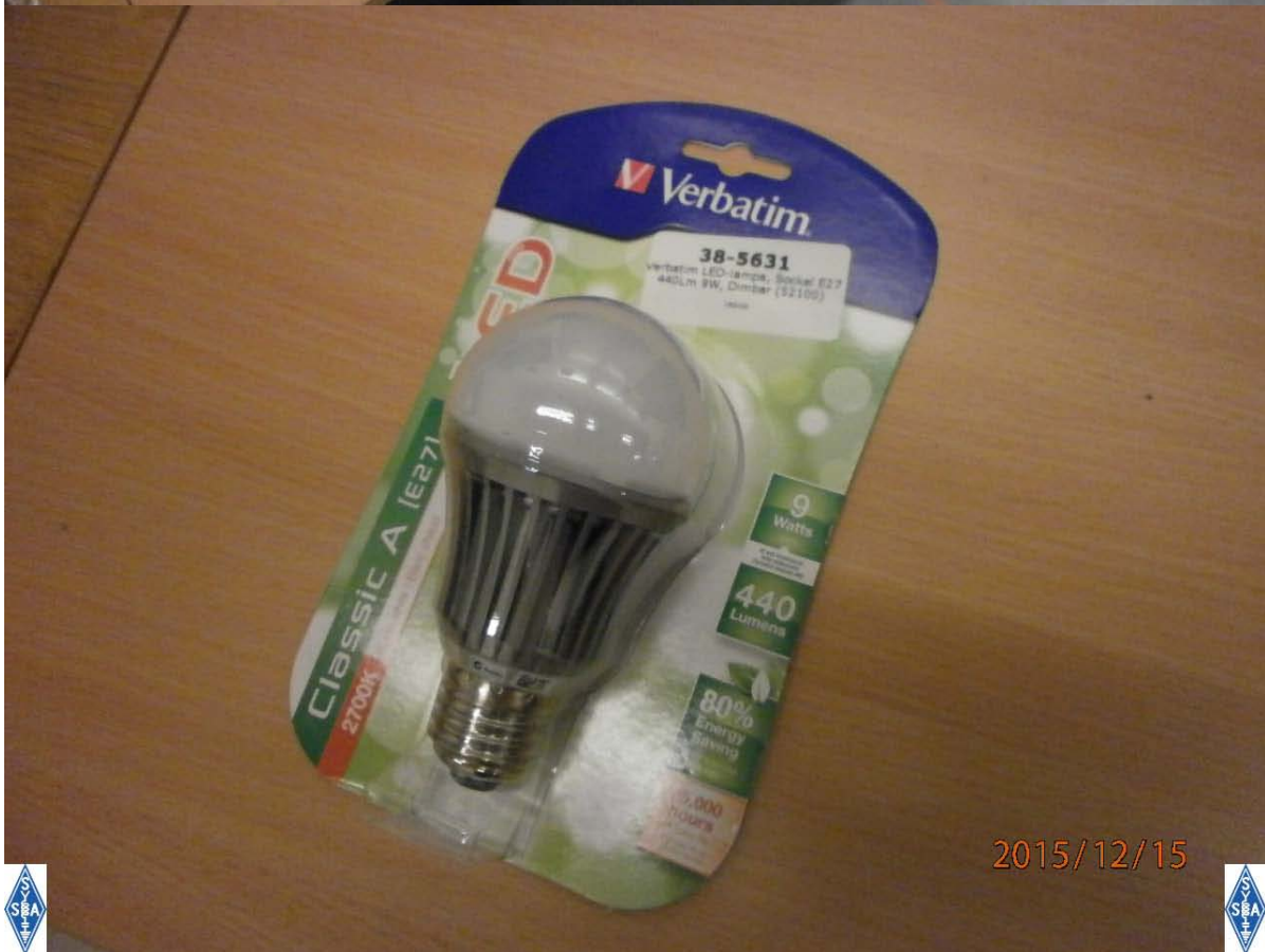
Actual test setup