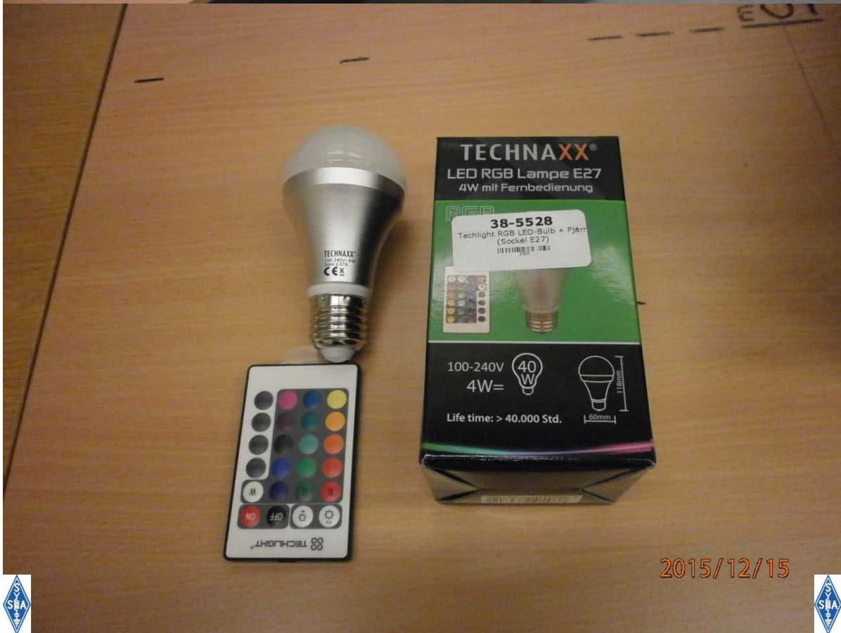
Actual test setup