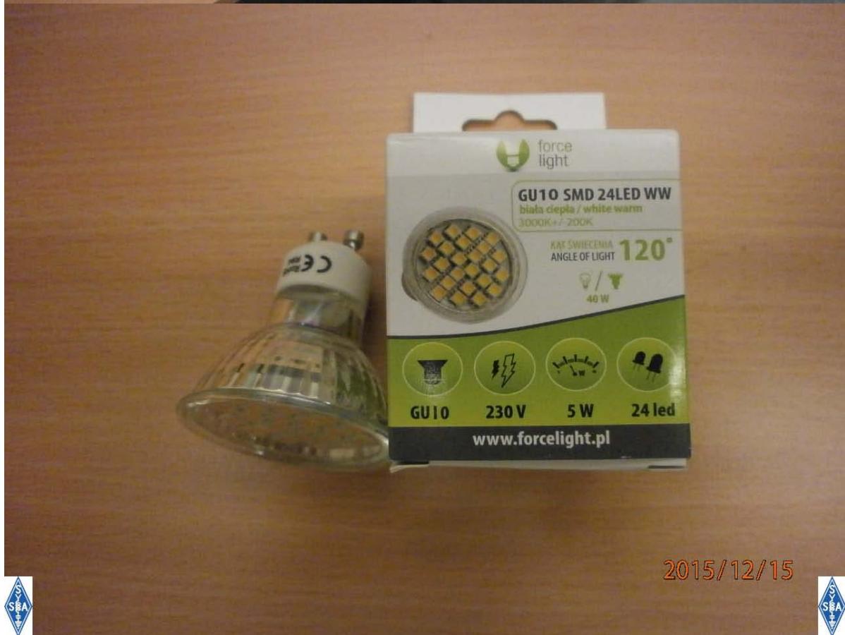
Actual test setup