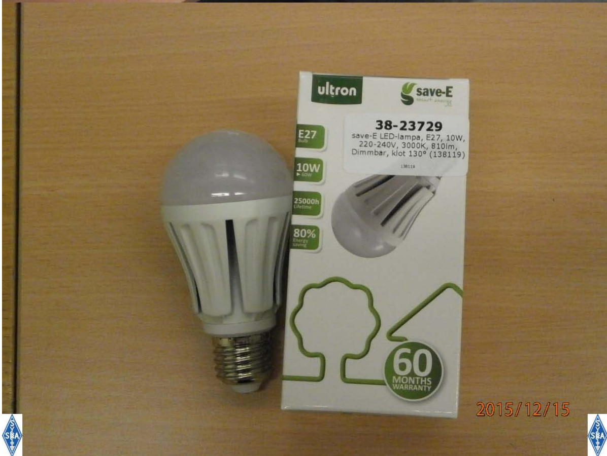
Actual test setup