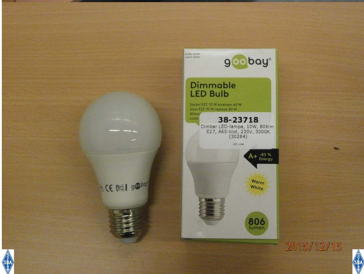
Actual test setup