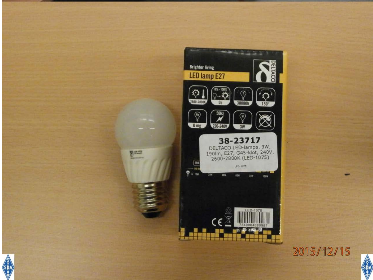
Actual test setup