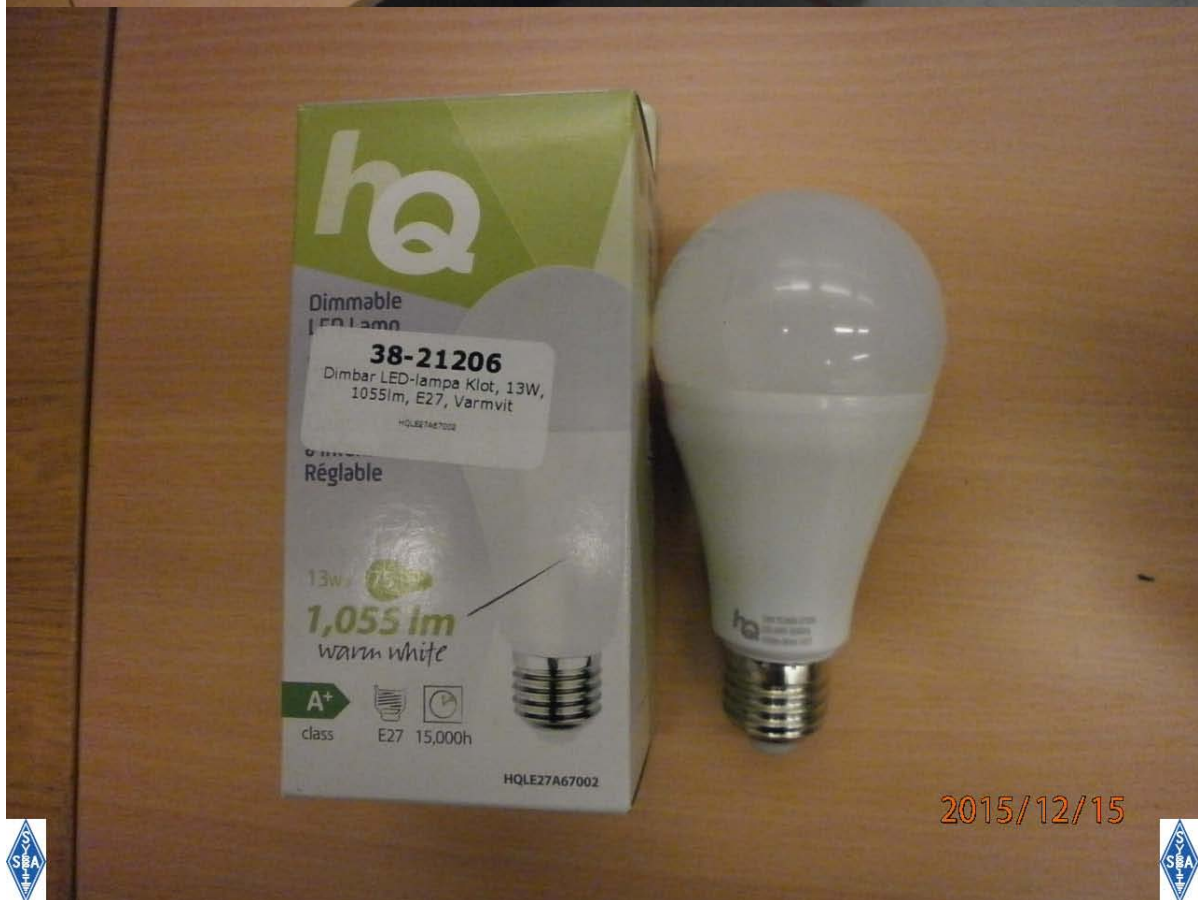
Actual test setup