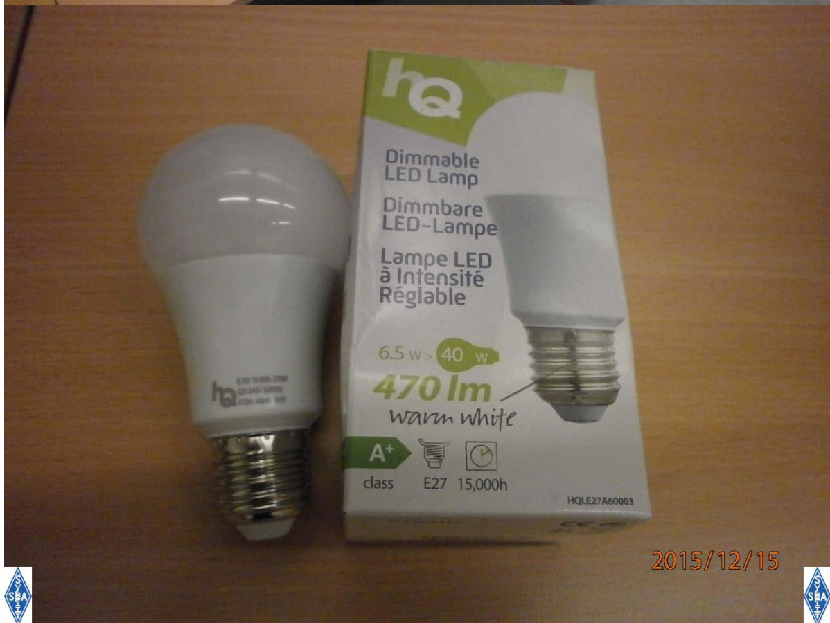
Actual test setup