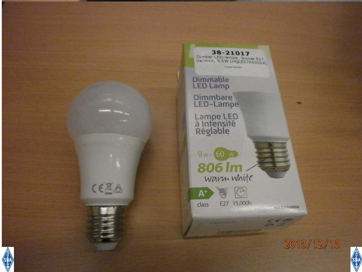
Actual test setup