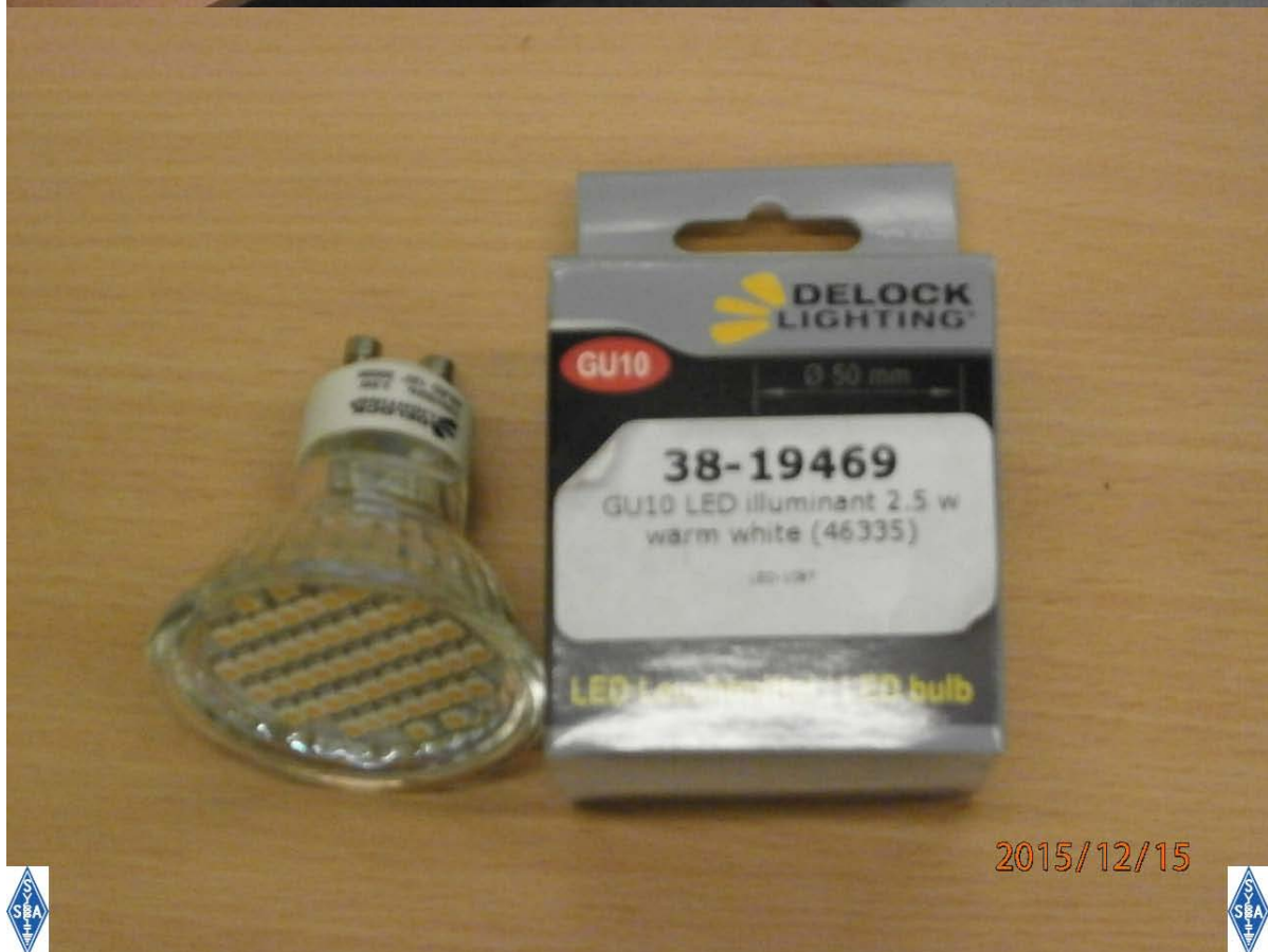
Actual test setup