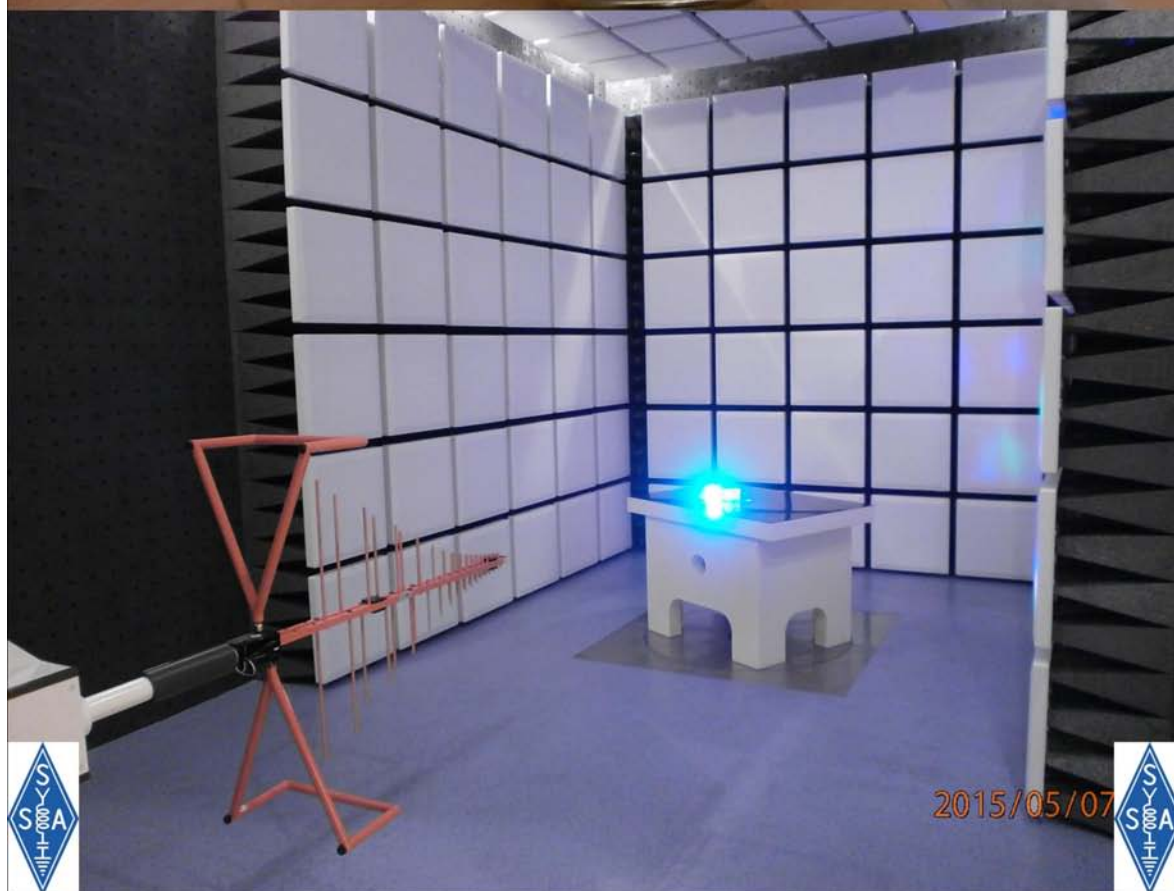
Actual test setup