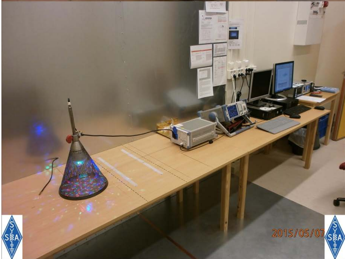
Actual test setup